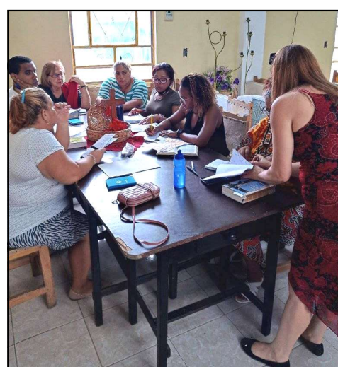
From left: a Reformation worship service, sharing food with those in the community, talking about Lutheranism.