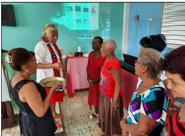
The celebration of Reformation at IEU included a service of adult baptism.