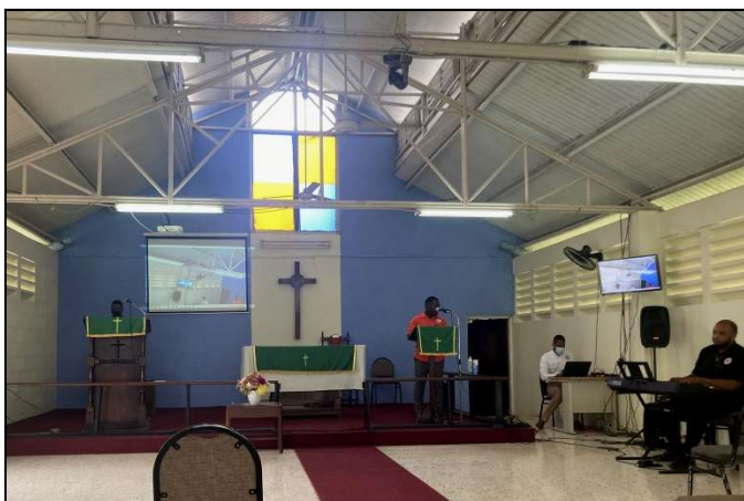
The chapel where students take turns leading worship at the United Theological College of the West Indies