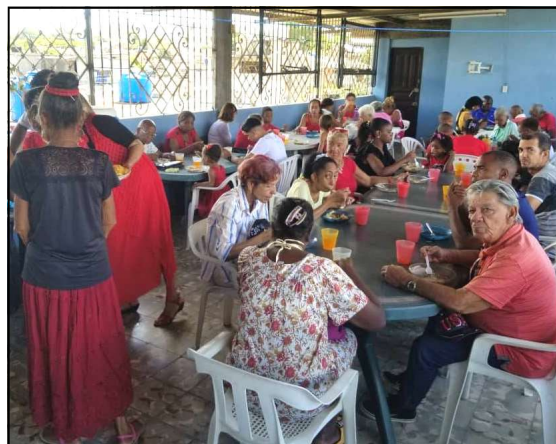
A time of sharing — of fellowship and food.

The pictures here offer a profound witness to the power of the gospel as a source of hope for those active in the worship and work of the IEU. On this page are scenes from various congregations' observances of Reformation Day, seen as an occasion for engaging in celebratory worship and a renewal of people's understanding of the tenets of Lutheranism.