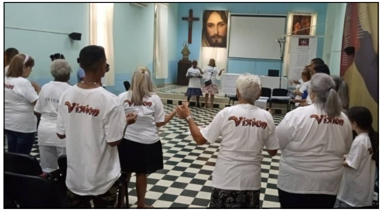
Praying together was a vibrant aspect of the retreat.

The photos on this page are from a weekend retreat that focused on spiritual wellness, self-care and Lutheran identity for pastors and lay leaders of the IEU congregations. It took place November 10-12 in the town of El Cobre in the municipality of Santiago de Cuba. The ELCA provided some funding for the gathering.