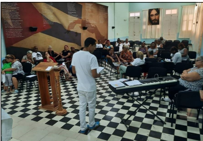
A workshop presentation on symbols of the church.