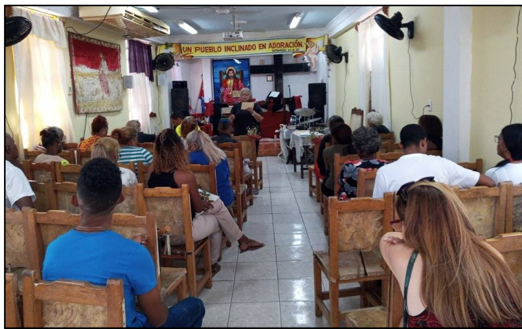
Reformation Sunday worship at the IEU headquarters church in Santiago de Cuba.