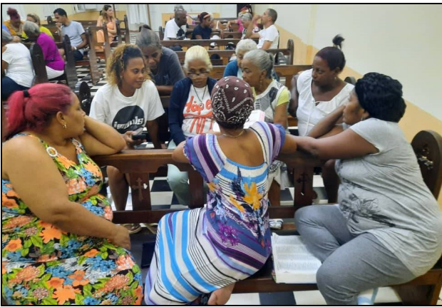
Animated small-group discussion during Bible study.