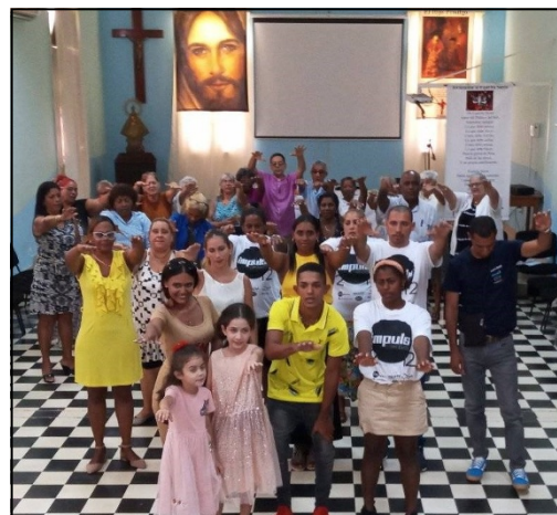
Gathering for the retreat closing blessing.