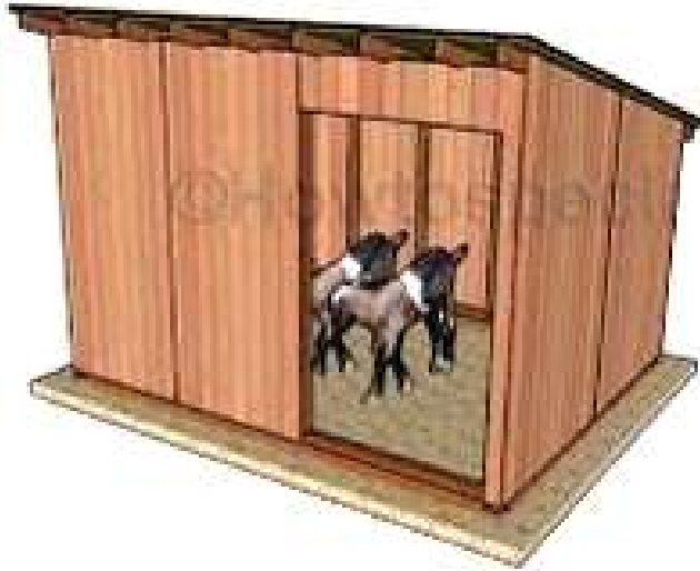
An artists' sketch of a shelter to be built to house male goats at a church in Les Cayes, Haiti.

With support from the Florida-Bahamas Synod, the Lutheran Church in Haiti and member families are embarking on a new goat farming project.