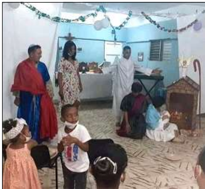
At Christmastime last year, youths and children portray a nativity scene at the Cristo Vive congregation of Cuba’s Evangelical United Church-Lutheran Synod.

A number of investigatory trips and conversations culminated in December 2019 with a group from the Florida-Bahamas Synod embarking on an immersion experience in Santiago de Cuba. The bonds established during this trip confirmed the desire of both parties to proceed with an accompaniment relationship. Both the