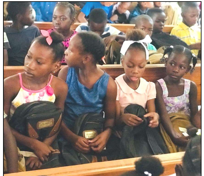
As schools that had been closed since last August’s earthquake began reopening recently, 500 Haitian schoolchildren received backpacks with school supplies, thanks to a grant to the Lutheran Church of Haiti from the Florida-Bahamas Synod.