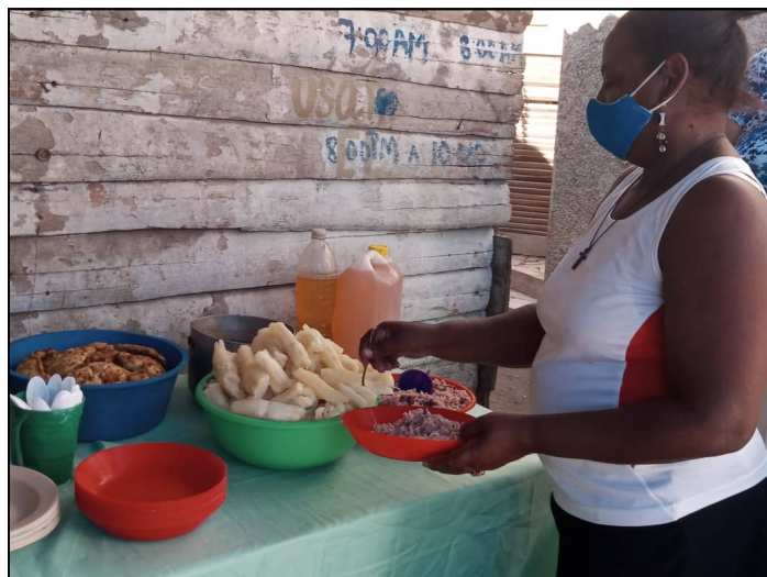
Left: Participants in the Cristo Vive children’s Christmas program receive applause. Above: A table abounds with taste treats for a traditional Cuban holiday meal.