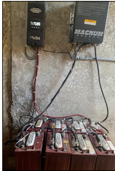
Solar panels (right) and batteries (above) installed at the Church Center in Gressier provide power for the office and a guest house.

Sharing prayers and resources is making a difference.