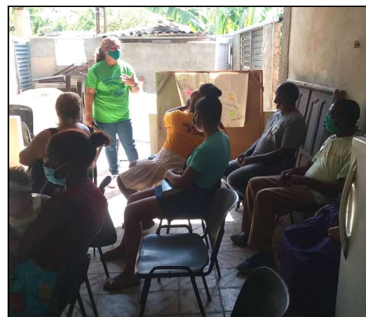
A Lutheran church gathering in Cuba for mutual support in the midst of the spread of Covid-19.

The Florida-Bahamas Synod is making efforts to send a Covid-19 financial relief gift to the IEU to help meet the needs of our companions.