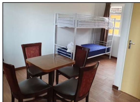
The exterior of the STICRIS shelter facility (top) and one of the rooms (above) where women can stay with their children for up to three months while getting support to deal with the trauma of domestic violence.

asm ignites a congregation, just as it provides funding for vital ministry.