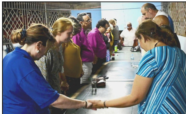
Left: Joining in prayer around a table in Cuba.