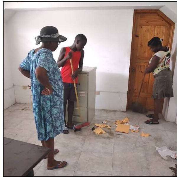
Lutheran members of the Gressier community in Haiti work on organizing the main office of l'Eglise Luthérienne d'Haiti there. The office has been fitted with new computers and software for bookkeeping and record keeping. The office will be powered by solar panels which have been purchased but not yet installed.