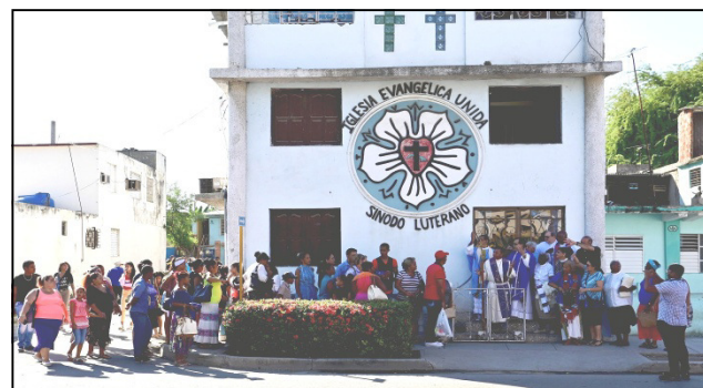
Left: Headquarters of the Iglesia Evangélica Unida-Sínodo Luterano in Santiago de Cuba.