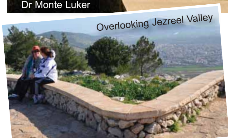
Overlooking Jezreel Valley